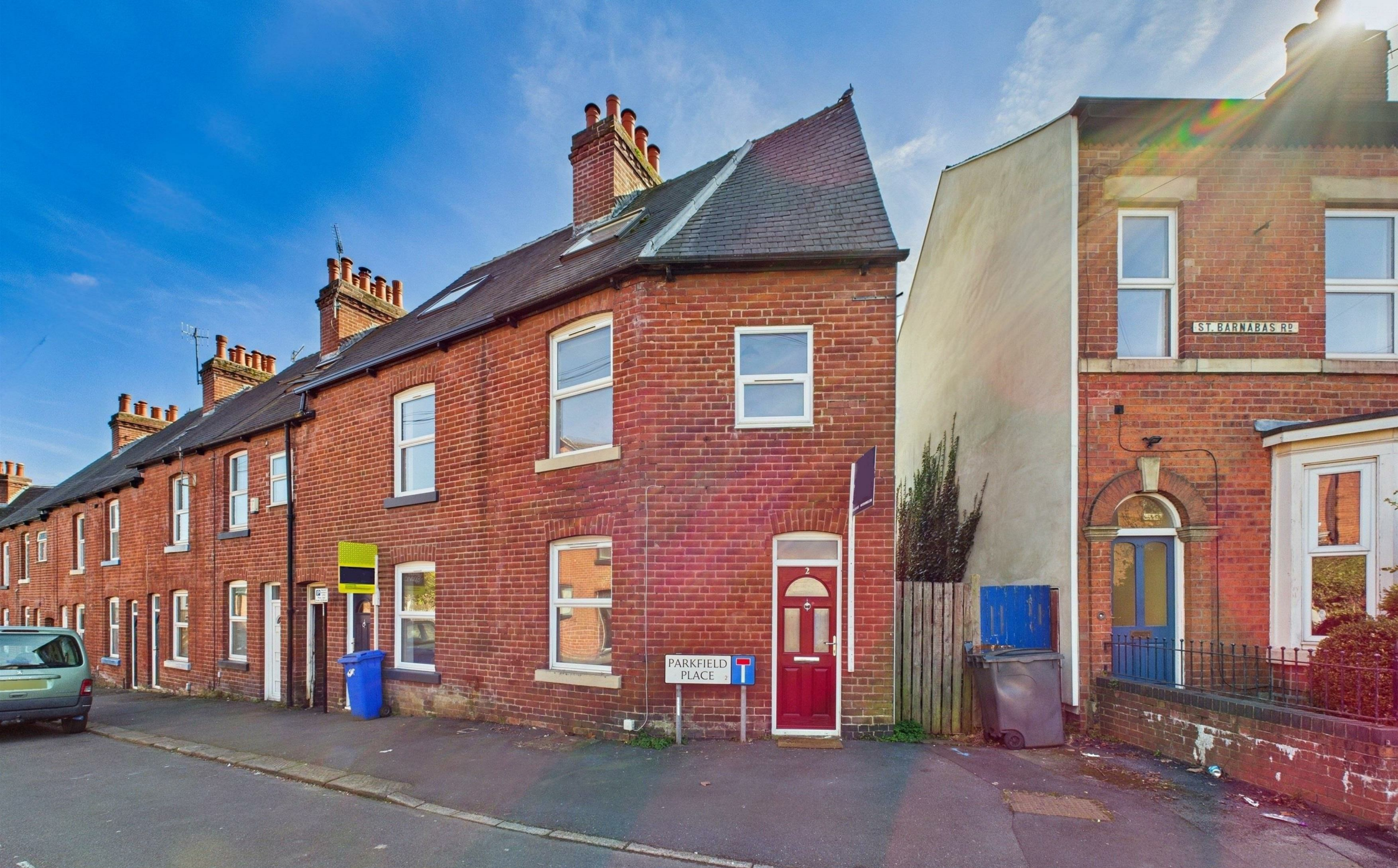
2 Parkfield Place, Highfield, Sheffield, S2 4TH